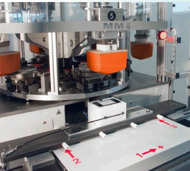
Photo: The position of the workpiece is corrected on axes 1, 2 and 3. In addition an angular correction is made by counter-directional movements of axis 2 and 3.

The system is equally suitable for printing on large workpieces because it can move to a number of different positions.