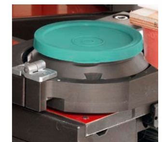
Patented MCI ink cup (compact colour dispensing system)