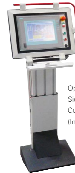
Operating panel Siemens S7 Controller (Industrial PC)